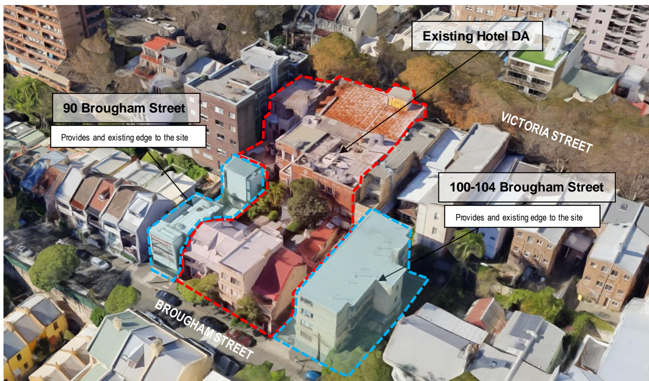
Figure 3 Perspective – looking generally north east