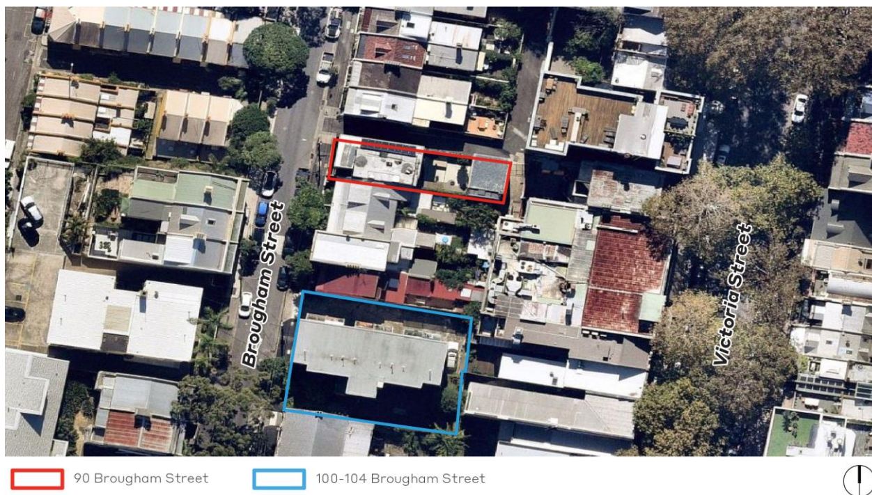
Figure 1 Aerial Photograph

90 Brougham Street, Potts Point is legally defined as Lot 15 Section 4 DP 28 and 100-104 Brougham Street, Potts Point is legally defined as SP 1560. An aerial photo of the sites is made available in Figure 1 .